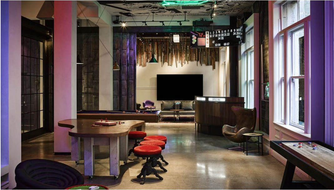
The Den: pool, games, and more. HOTEL ZEPPELIN

Now, onto the really fun stuff. Downstairs, the hotel has constructed a positively enormous games room called The Den. There's a massive pool table, a large selection of games, a (free) skeeball machine, big TVs which you can tune to any channel, and various colorful lounges. One could happily spend a whole morning or afternoon sipping cocktails, playing pool and watching Shaqtin' a Fool.