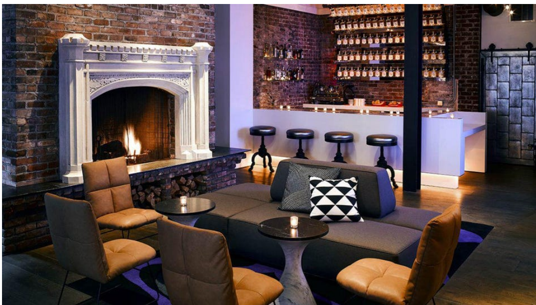
The Mantel Bar, in the lobby. HOTEL ZEPPELIN

First, there's a welcome cocktail for everyone checking in. Next, the lobby area doubles as a comfortable guest lounge and bar that pays tribute to the cafes of the beatnik era. There's a (working) fireplace, plush lounges, and a communal dining table. There's also live entertainment in this space on Friday evenings, from 6-9pm: usually a singer-songwriter act, performing right by the fireplace.