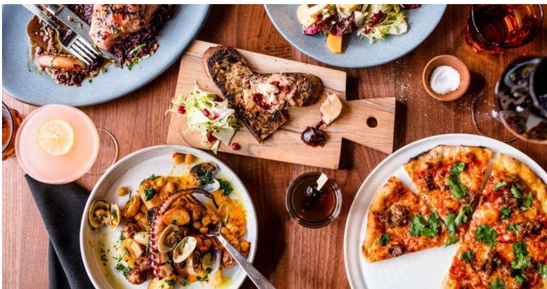
The Rambler. HOTEL ZEPPELIN

The restaurant also does a full brunch and lunch — try "The Rambler": two eggs, two buttermilk pancakes, crispy potatoes, and your choice of bacon, chorizo or pork belly. Indulgent, but then again, why not? The restaurant also has a hefty happy hour menu on offer (if you're not too busy in the games room), including a marvelous oysters-and-prosecco-deal: half a dozen oysters and a glass of prosecco for just $20.